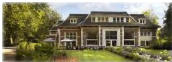
YMCA Hotel "Ernst Sillem Hove" Soestdijkerweg 10b – 3734 MH – Den Dolder, NL Netherlands